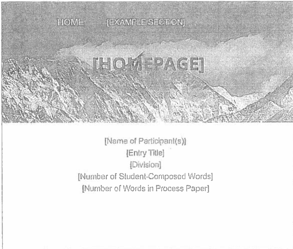
FIGURE 8 | SAMPLE WEBSITE HOME PAGE